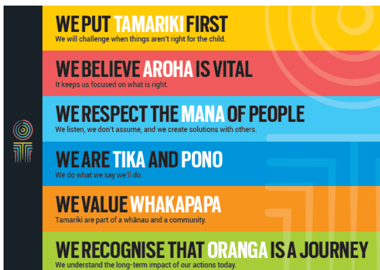
Figure 1: The Oranga Tamariki Way

We know that we will only achieve the vision and purpose if we continue to engage more directly with our partners, our communities and all New Zealanders who share our goals. This means early involvement of our partners in planning processes, sharing learning about what works, combining resources so that we can provide genuine tamariki-centred support; and, continually challenging each other to do better for all rangatahi.